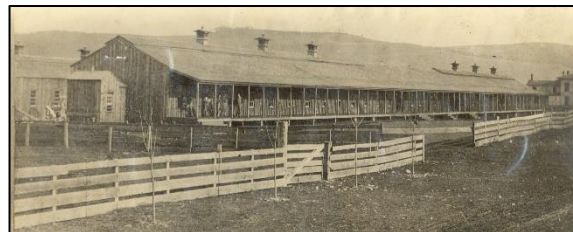
Above: US Hospital